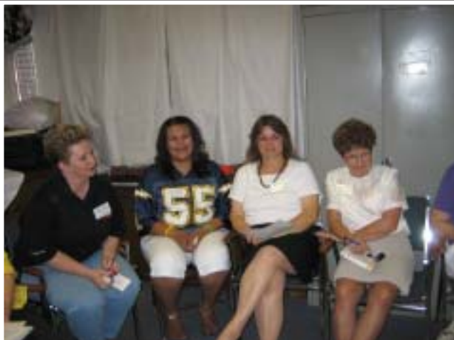
Mentor Match Meeting in August 2005

There is an opening to help out at our reception desk for several mornings or afternoons (9-1 or 1-4) and for our children's area to assist in loving and assisting our kids (usually 2-3 hours per week.)